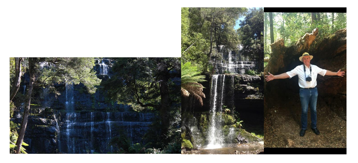
Bonorong Wildlife Sanctuary