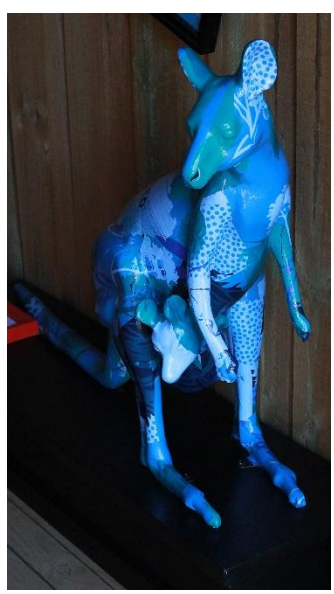
Hobart, Australia was very nice!