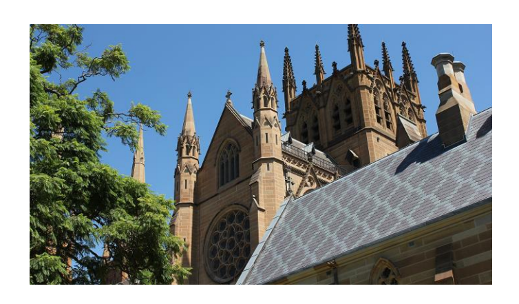
Misc. Pictures -- Darling Harbor, Bondi Beach, Darling Harbor, Watson's Bay, Sydney Ferry