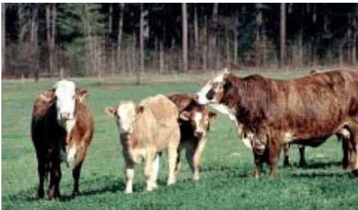
Winter pasture also works well for cow-calf operations.

peaks in the spring. If overseeded with late maturing annuals, the first hay harvest with the highest nutritive value is lost.