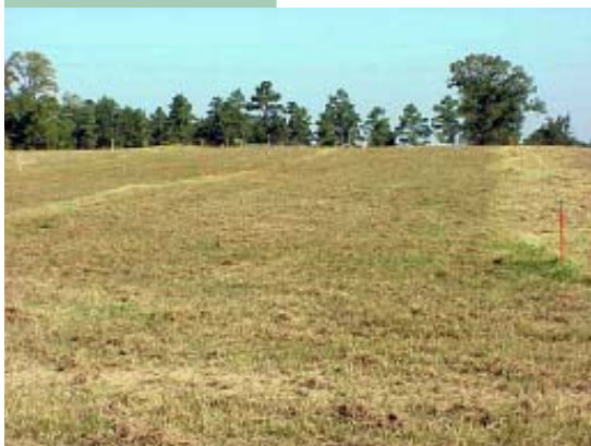
Lightly disked bermudagrass pasture.

Another practice to reduce the warm-season grass competition is a light disking about 1 to 2 inches deep. With bermudagrass growing on sandy soils, the total sod can be disked, as the bermudagrass will recover in the spring from stolons, rhizomes, and roots.