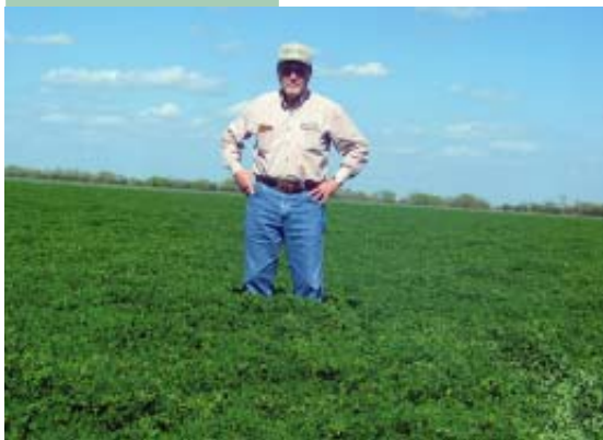
'Devine' little burr medic seed production field.

Pogue Agri Partners Inc in Kenedy, TX has been licensed by the Texas Agricultural Experiment Station to produce seed of Devine little burr medic. Pogue Agri Partners will be selling Devine pre-inoculated and coated. Our research shows that pre-