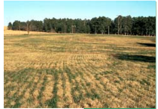
Rye-ryegrass seedlings emerging within 2-3 weeks of planting.

"Overseeding warm-season perennial grasses with cool-season annuals in the southeastern U.S. has many benefits..."