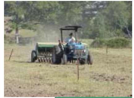
Drilling small grain and "broadcasting" ryegrass in one pass.

Annual ryegrass is the most popular cool-season annual for overseeding in the southeastern US. It is adapted to all soil types and does better on poorly drained soils than the small grains (12). In contrast to the small grains, successful ryegrass stands can be obtained by broadcasting the seed on the soil surface, especially on bermudagrass and dallisgrass sods. Disking tight bahiagrass sods is usually necessary