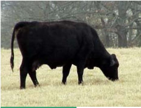
Cattle readily graze frosted bermudagrass.

winter. Stockpiled bermudagrass can provide the required nutrition for dry, pregnant cows through January if the appropriate procedure is followed. Producers should plan on providing approximately 45 - 60 days of grazing with the dormant bermudagrass.