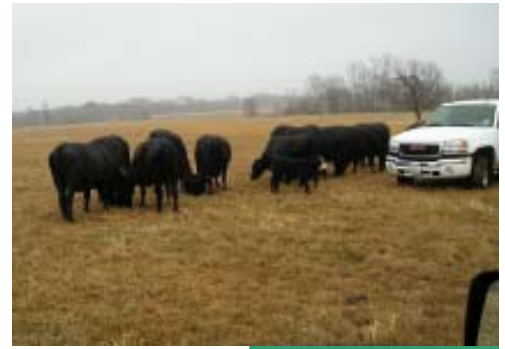
Grazing trial study on stockpiled bermudagrass in Wood County.