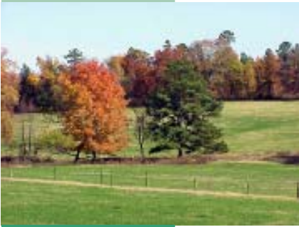
Cool-season annual forage overseeded into bermudagrass pastures.

In both scenarios small grain seed should be placed from 1/2 to 1 inch deep for good stands. If the small grain seed is broadcast