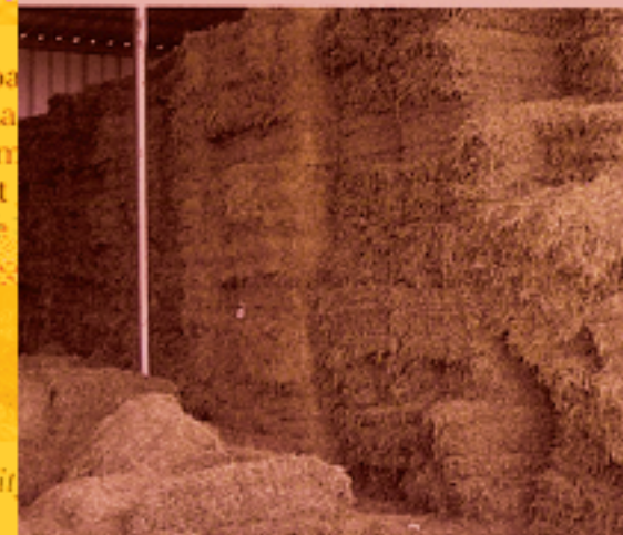
Quality varies by cutting — hay on right